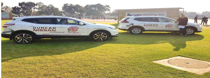
Kindly Donated by Duncan Nissan